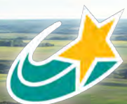
Aerial view of the museum grounds during the 67 th Manitoba Threshermen’s Reunion and Stampede, July 2023